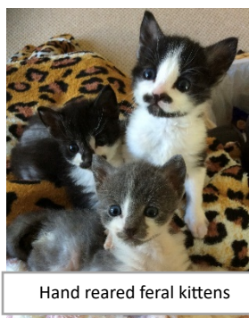
Hand reared feral kittens

It also provided the opportunity to work with the committee and charity to help organise and run fundraising events and continued improvement of the facilities and veterinary care on the island.